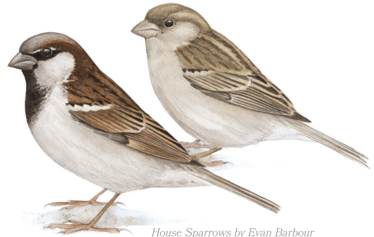
House Sparrows by Evan Barbour

This is such a common bird that you might not notice it. Sometimes you’ll see this small bird inside stores, hopping around outdoor restaurants, or flocking in cities. The House Sparrow takes frequent dust baths. It throws soil and dust over its feathers, just as if it were bathing with water, to help maintain oil on its feathers.